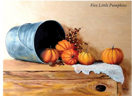
Five Little Pumpkins

"I like to create a scene that draws the viewer into painting, to become a part of it. Life is in the painting, and I want the viewer to experience the moment, the same moment that inspired me and to enjoy it."