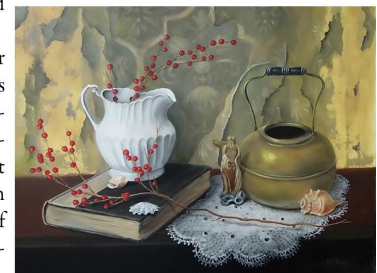
^ Tattered Wall

"The learning and growing never stops, as each new work of art shows me not only where I am in my art currently, but where I want to go" she relates. "My art is very much like a best friend to me. It has taken me through difficult times and given me a sense of purpose when my life needed that extra support and balance."