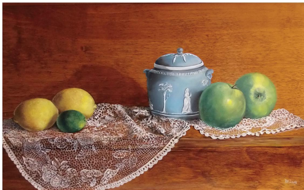
<Blue Spice Jar

She moved from drawing to oil painting in her late teens. She visited galleries to study famous works, and